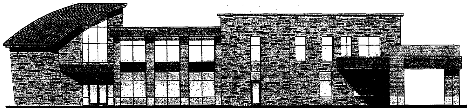
4 WEST ELEVATION A3 1/8"=1'-0"

I HEREBY CERTIFY THAT THIS PLAN, SPECIFICATION OR REPORT WAS PREPARED BY ME OR UNDER MY DIRECT SUPERVISION AND THAT I AM A DULY LICENSED ARCHITECT UNDER THE LAWS OF THE STATE OF SOUTH DAKOTA.