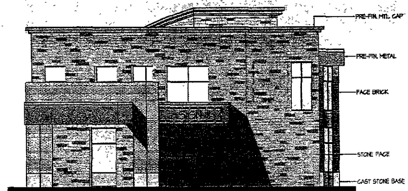
3 SOUTH ELEVATION A3 1/8"=1'-0"