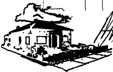
CITY HALL 1903