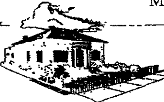
CITY HALL 1903

616 Sixth St. * Rapid City, SD 57701 * 605/721-7310 FAX: 605/721-7313 * E-MAIL: Gary@RennerAssoc.com * Spearfish 605/717-0016 *