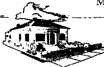
CITY HALL 1903

616 Sixth St. * Rapid City, SD 57701 * 605/721-7310 FAX: 605/721-7313 * E-MAIL: Gary@RennerAssoc.com * Spearfish 605/717-0016 *