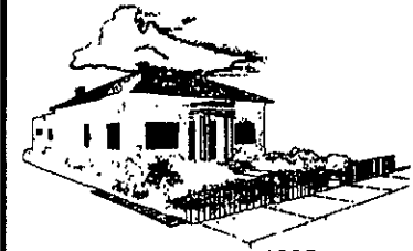
CITY HALL 1903