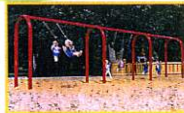
5" OD Arch Swing, with 6 Belt Seats #714-852-6S • $4,267