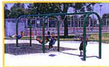
5" OD Arch Swing, with 4 Belt Seats #714-852-4S • $3,019