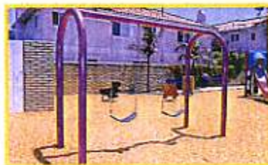
5" OD Arch Swing, with 2 Belt Seats #714-852-2S • $1,778

RECEIVED AUG 26 2008 Rapid City Growth Management Department