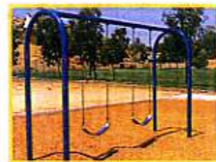
3 1/2" OD Arch Tot Swing, with 2 Belt Seats #718-852-2S • $992