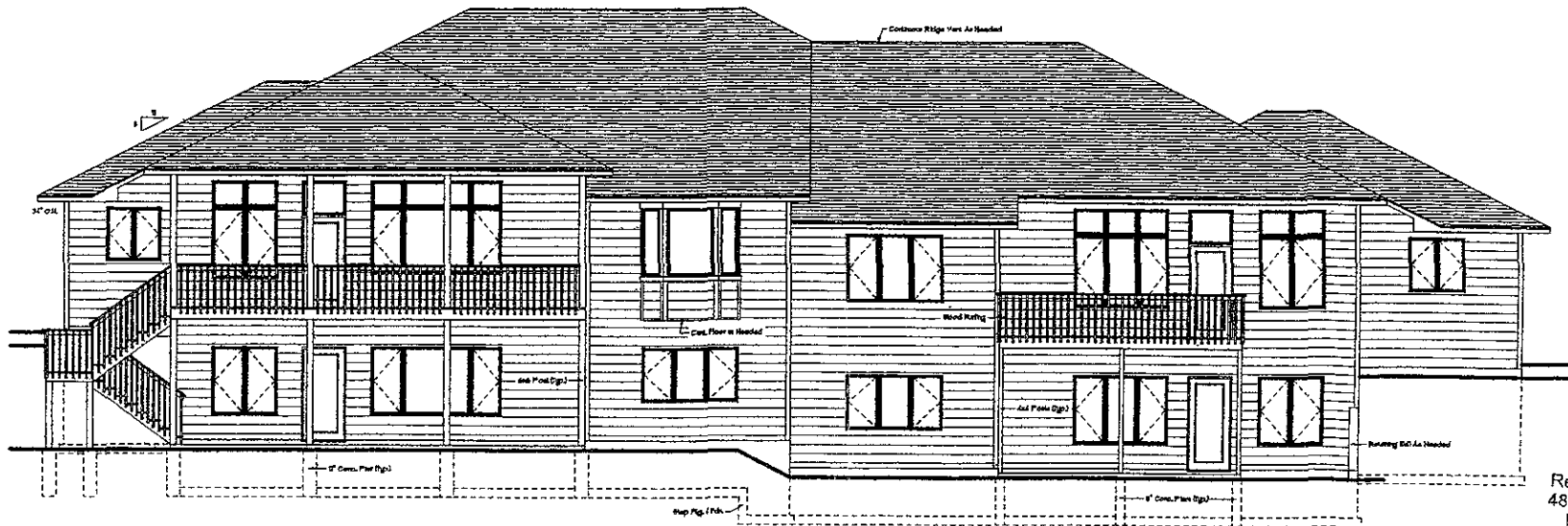
REAR ELEVATION Scale: 1/4"=1'-0"

Reyelts Construction, Inc. 4801 Enchanted Pines Dr. Rapid City, SD 57701 605-718-4646