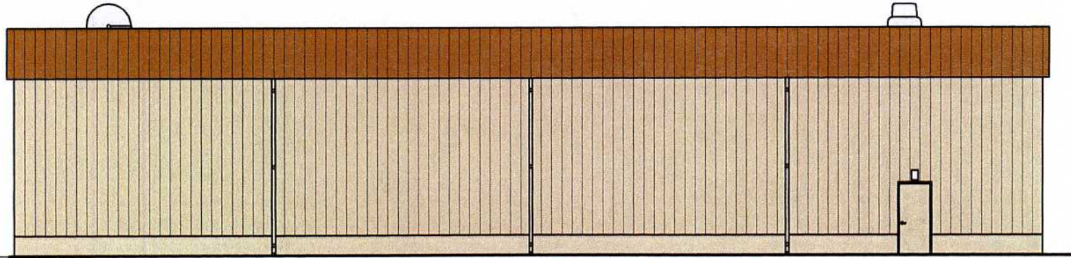
WEST ELEVATION NOT TO SCALE