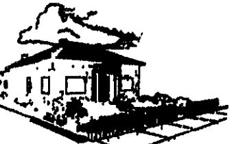
CITY HALL 1903