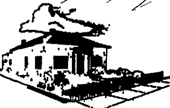
CITY HALL 1903

616 Sixth St. * Rapid City, SD 57701 * 605/721-7310 FAX: 605/721-7313 * E-MAIL: Gary@RennerAssoc.com * Spearfish 605/717-0016 *