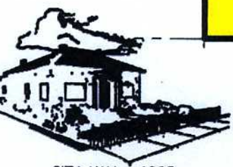
CITY HALL 1903