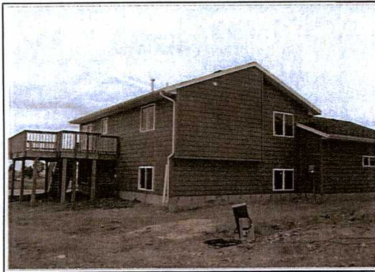
REAR OF SUBJECT PROPERTY