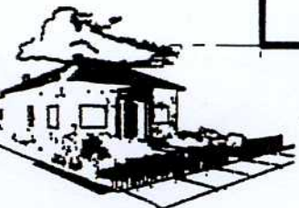
CITY HALL 1903