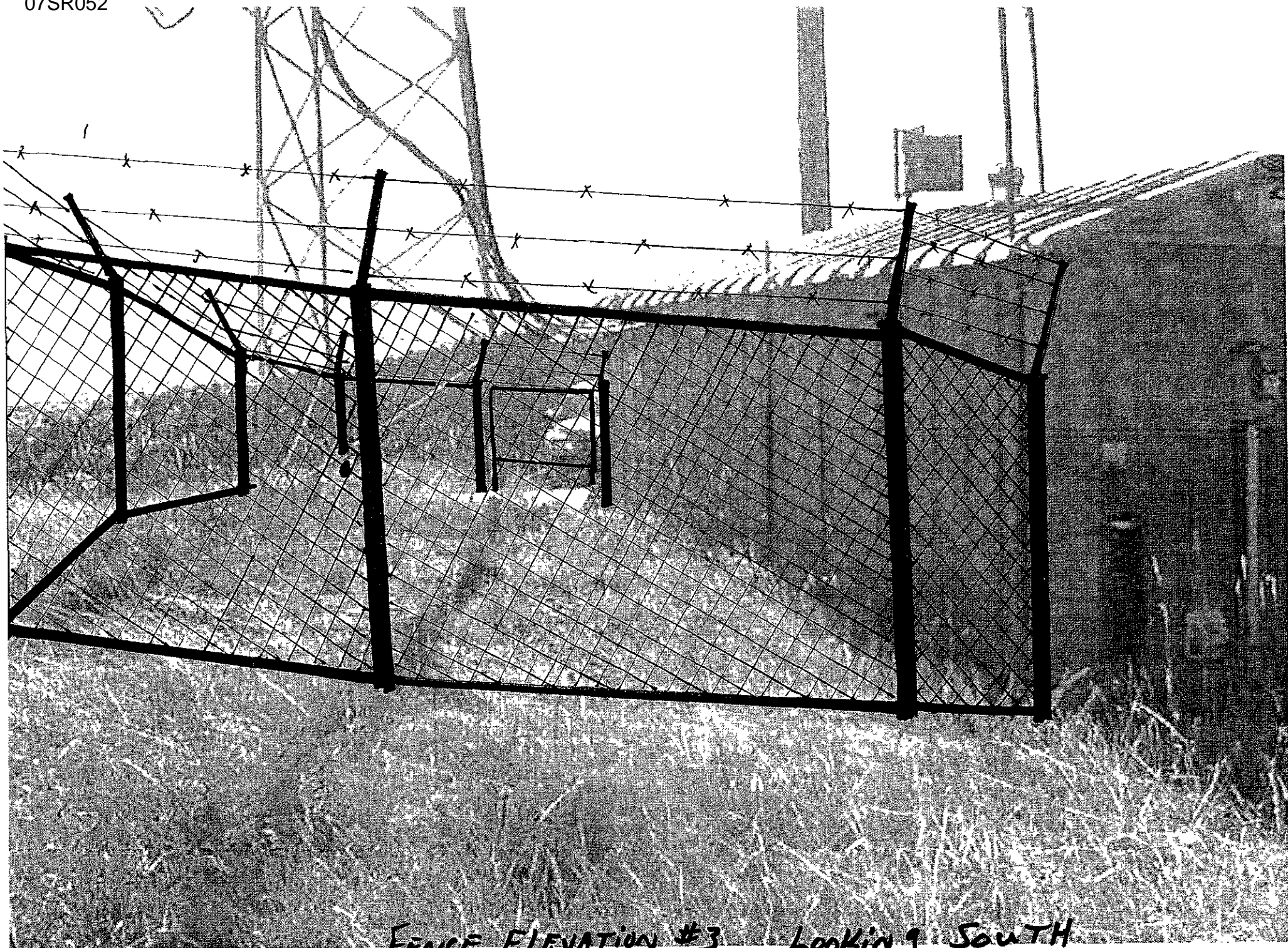
FENCE ELEVATION #3 Looking South