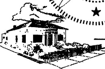
CITY HALL 1903