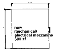
MEZZANINE PLAN SCALE 1/8" = 1'-0"