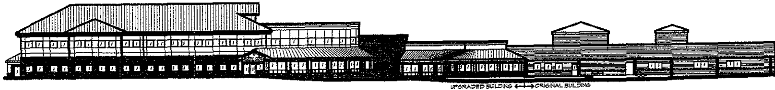
BLACK HILLS SURGERY CENTER - EXISTING EAST ELEVATION

WILLIAMS & ASSOCIATES ARCHITECTURE, P.C.