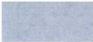
Ash Gray (25)