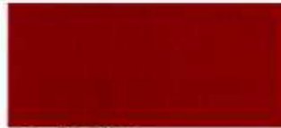
Patriot Red (73) 1,3