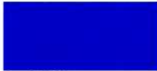
Ocean Blue (35) 3