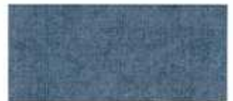
Zinc Grey (29) 3