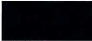
Burnished Slate (49) 3