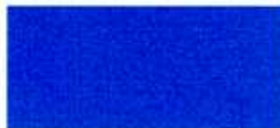
Hawaiian Blue (70)