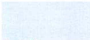
Polar White (80) 1