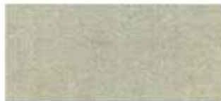
Khaki (88) 1,3