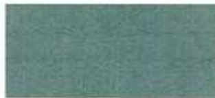
Patina Green (58) 1