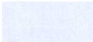
White (30) 1