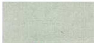
Light Stone (63) 1