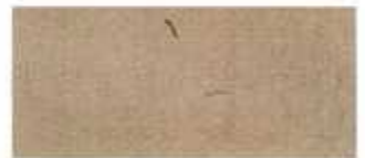
Mocha Tan (22)