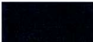
Burnished Slate (49)