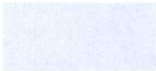
Linen White (81) 1,2

26 Gauge, Kynar 500®/Hylar 5000 Paint Finish