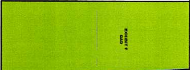
EXHIBIT F OAD