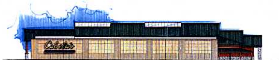
SECTION 04 - ELEVATION