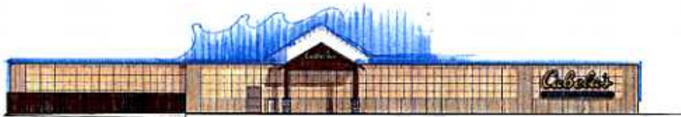
SECTION 03 - ELEVATION