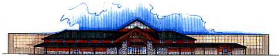
SECTION 01 - ELEVATION