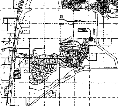
Rapid City Key Map NTS