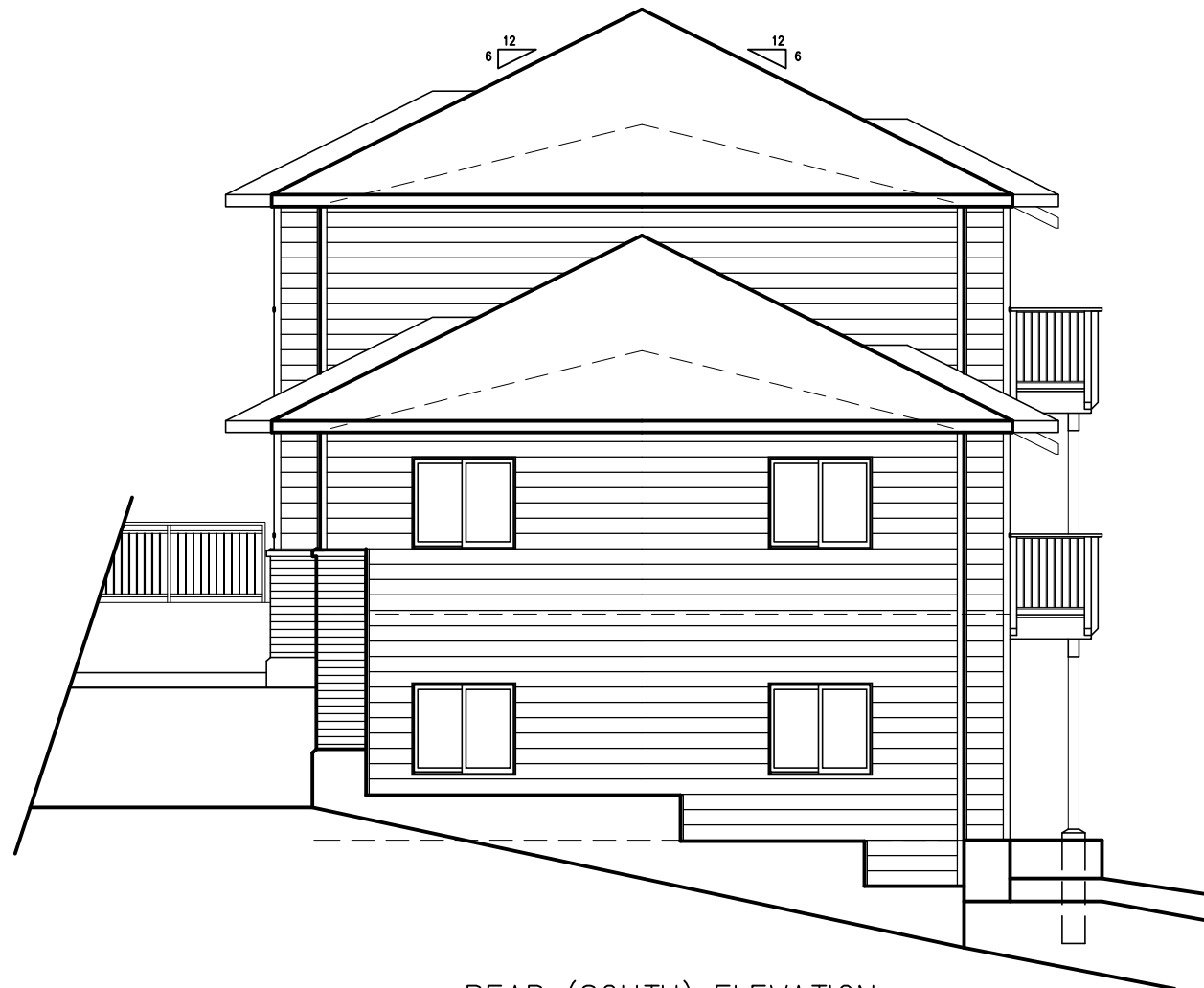
REAR (SOUTH) ELEVATION