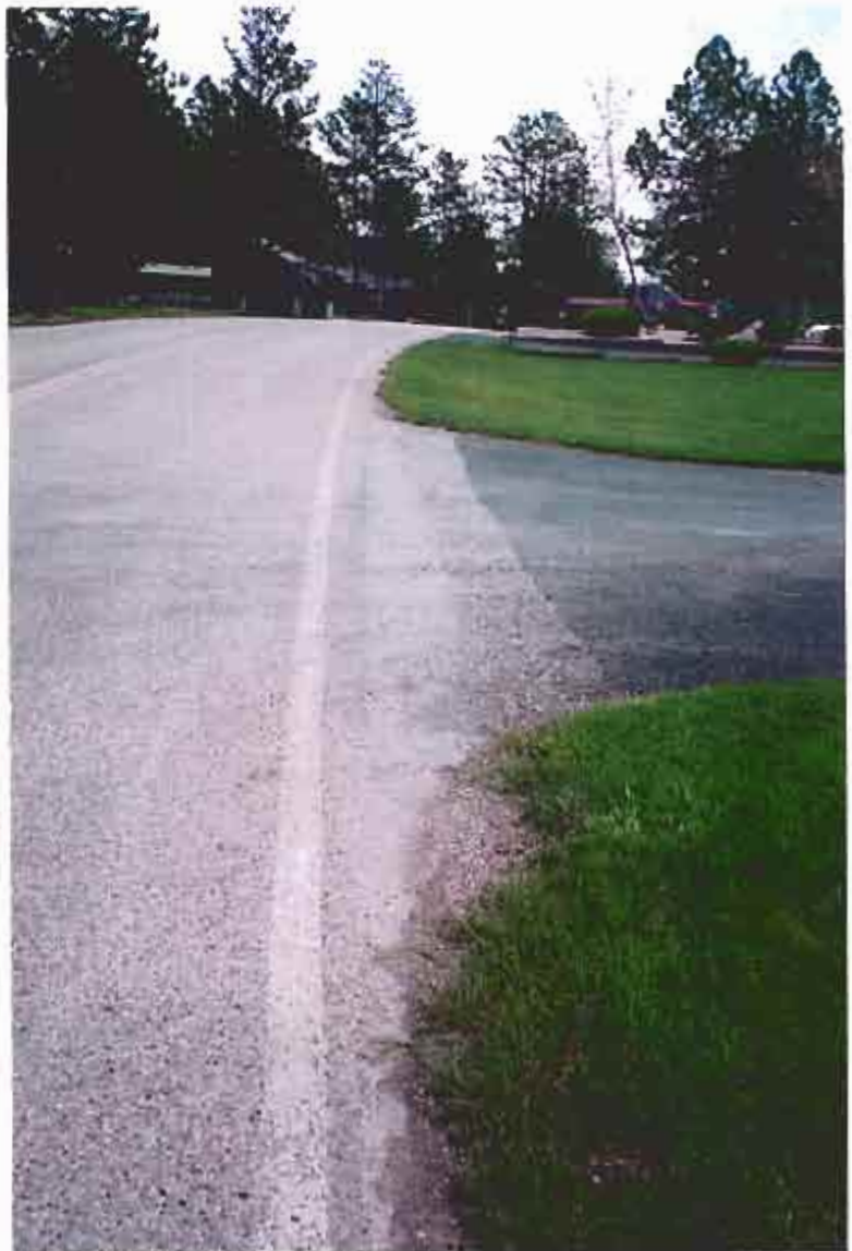
#2- At right Current road surface south lane of Sun Ridge Road heading easterly from existing cul-de-sac