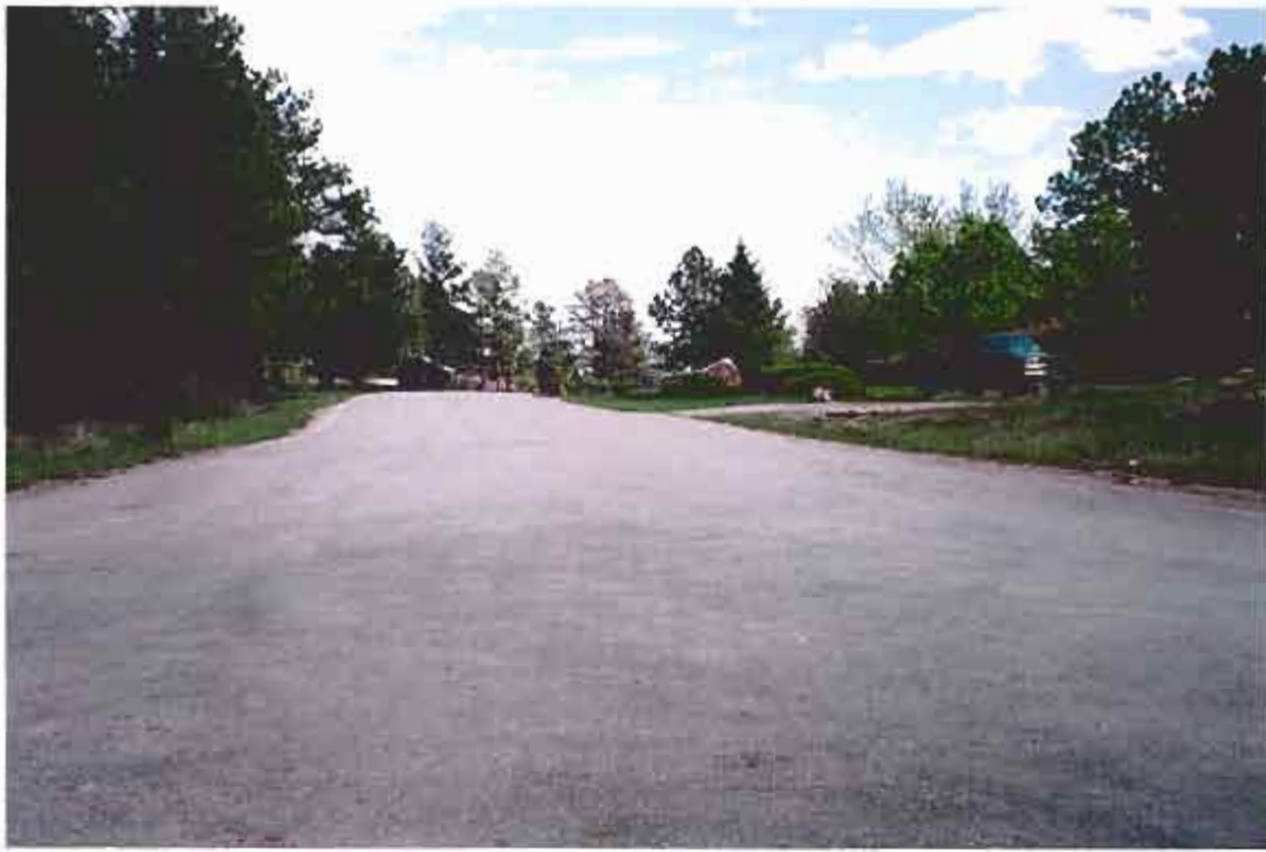
#1 Above: Current Terminus of Sun Ridge Road