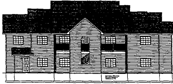
REAR ELEVATION SCALE 1/8" = 1'-0"