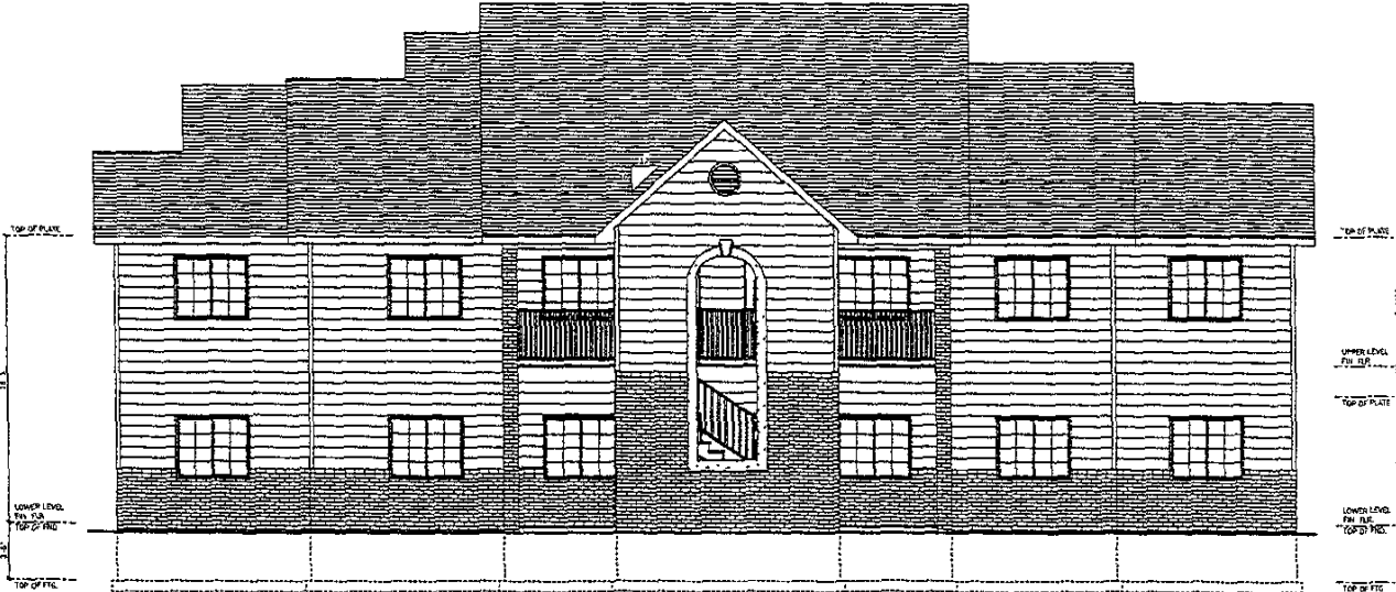
FRONT ELEVATION SCALE 1/4" = 1'-0"

United Building Centers Drawn for: J.D. MUTH PROPERTIES Contractor: JOE MUTH Drawn By: ROB BUSSETTI Date: 05/17/04 Project: 04PD078 LOT 3 BLK 7 AUBURN HILLS, MI 48003