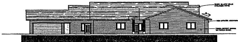
① NORTHEAST ELEVATION 10' - 10"