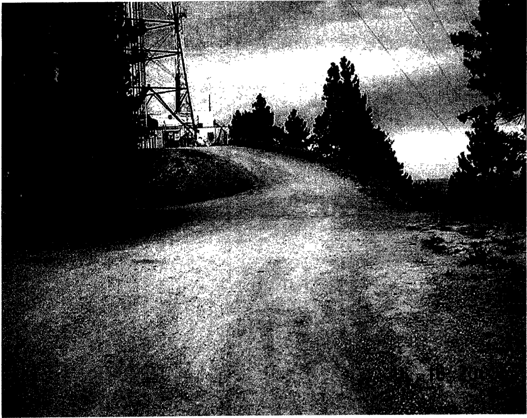
Main Road Approach