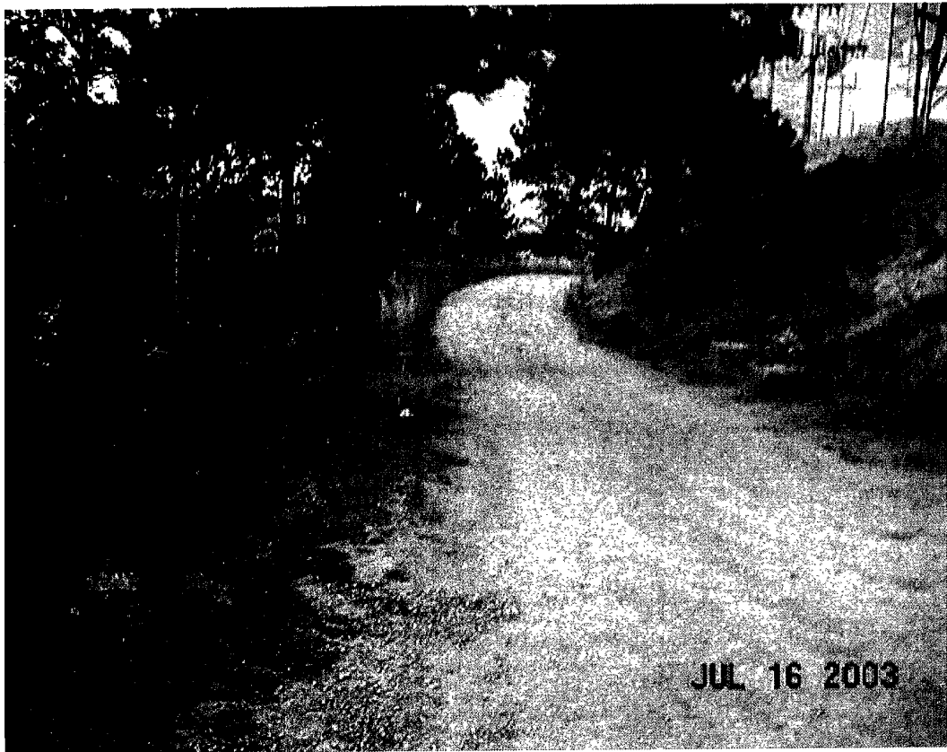
West Gate Road Approach