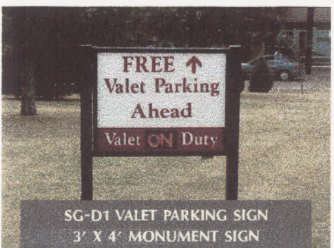
SG-D1 VALET PARKING SIGN 3' X 4' MONUMENT SIGN