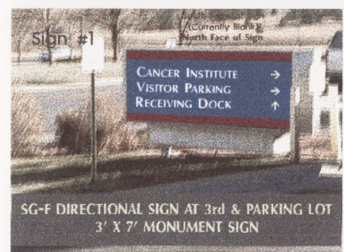
SG-F DIRECTIONAL SIGN AT 3rd & PARKING LOT 3' X 7' MONUMENT SIGN