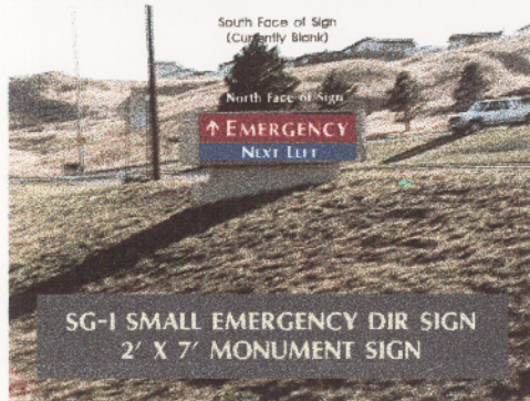
SG-I SMALL EMERGENCY DIR SIGN 2' X 7' MONUMENT SIGN