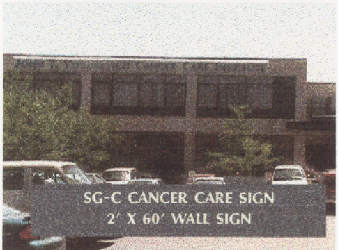
SG-C CANCER CARE SIGN 2' X 60' WALL SIGN