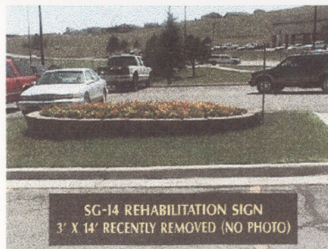
SG-I4 REHABILITATION SIGN 3' X 14' RECENTLY REMOVED (NO PHOTO)