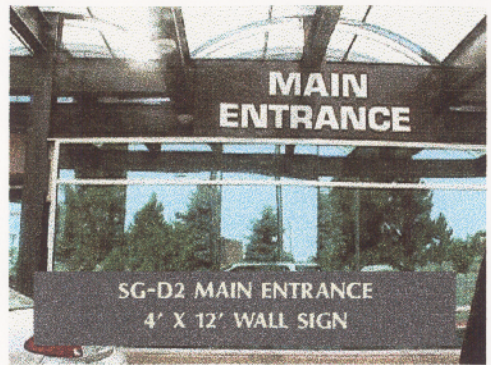
SG-D2 MAIN ENTRANCE 4' X 12' WALL SIGN