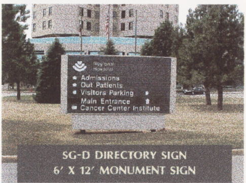
SG-D DIRECTORY SIGN 6' X 12' MONUMENT SIGN