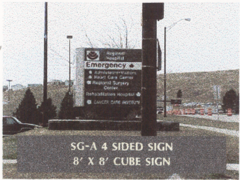
SG-A 4 SIDED SIGN 8' X 8' CUBE SIGN

FUTURE RENOVATION TO ADD INFORMATION TO SIGN