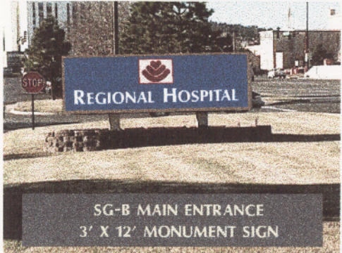
SG-B MAIN ENTRANCE 3' X 12' MONUMENT SIGN