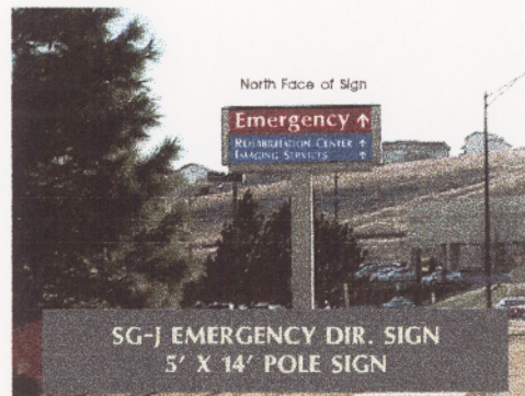
SG-J EMERGENCY DIR. SIGN 5' X 14' POLE SIGN