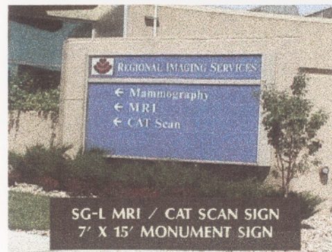
SG-L MRI / CAT SCAN SIGN 7' X 15' MONUMENT SIGN