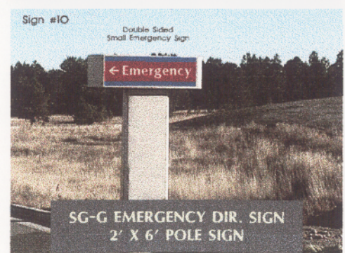
SG-G EMERGENCY DIR. SIGN 2' X 6' POLE SIGN