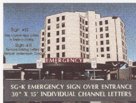
SG-K EMERGENCY SIGN OVER ENTRANCE 30" X 15' INDIVIDUAL CHANNEL LETTERS