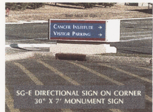
SG-E DIRECTIONAL SIGN ON CORNER 30" X 7' MONUMENT SIGN