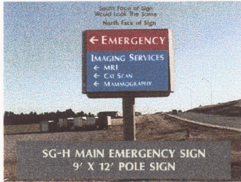
SG-H MAIN EMERGENCY SIGN 9' X 12' POLE SIGN