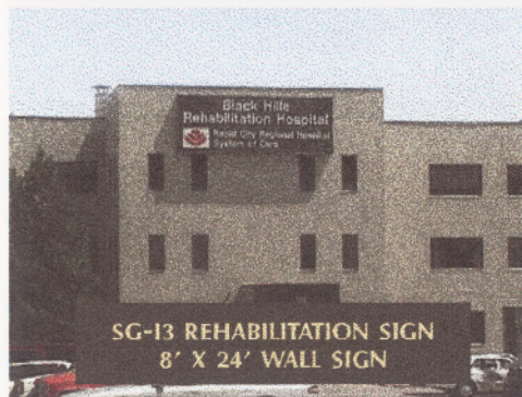
SG-I3 REHABILITATION SIGN 8' X 24' WALL SIGN