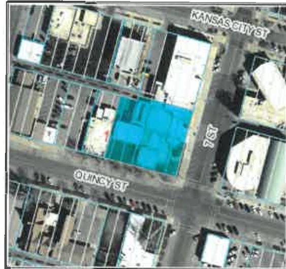
Parcel highlighted in blue