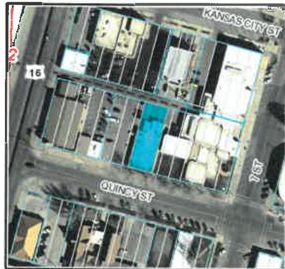
Parcel highlighted in blue