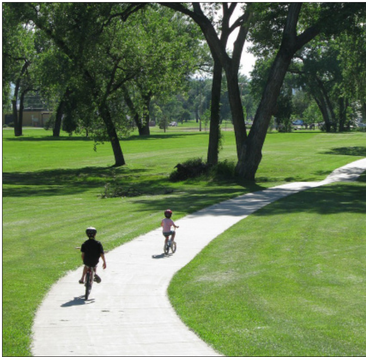
Walking and bicycling are safe and healthy modes of transportation and recreation that contribute to quality of life.