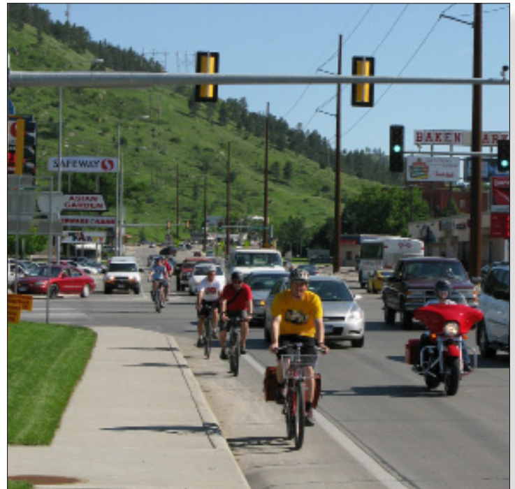
Bike lanes provide key on-street access for commuting to work, shopping, or connecting to the existing off-street trail system.