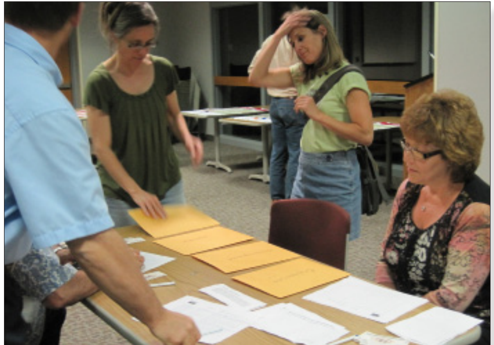
Rapid City residents and stakeholders provided important input into the development of this Plan.

Rapid City area residents, community stakeholder groups and public agency staff helped guide the development of this Plan. Public input about the opportunities and challenges to better bicycling and walking in the Rapid City area was obtained in several ways, including two public input workshops (June 2010 and April 2011), a community survey and through project steering committee meetings.