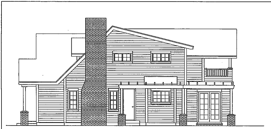
4 EAST ELEVATION A2.1 1/4"=1'-0"