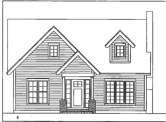
2 FRONT ELEVATION-AFTER A2.1 1/4"=1'-0"