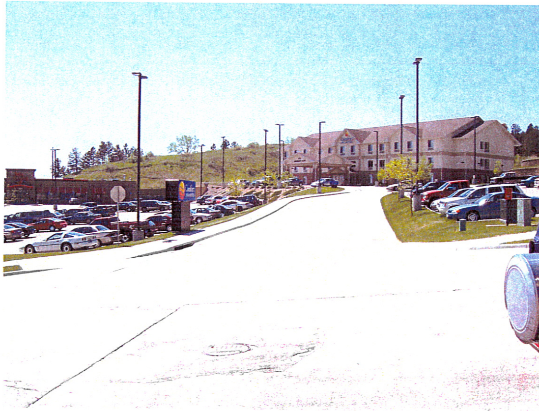
Comfort Inn & Suites Sign No. 3 At Access Road to Comfort Inn Site near Fairmont Blvd: 50 Square Feet