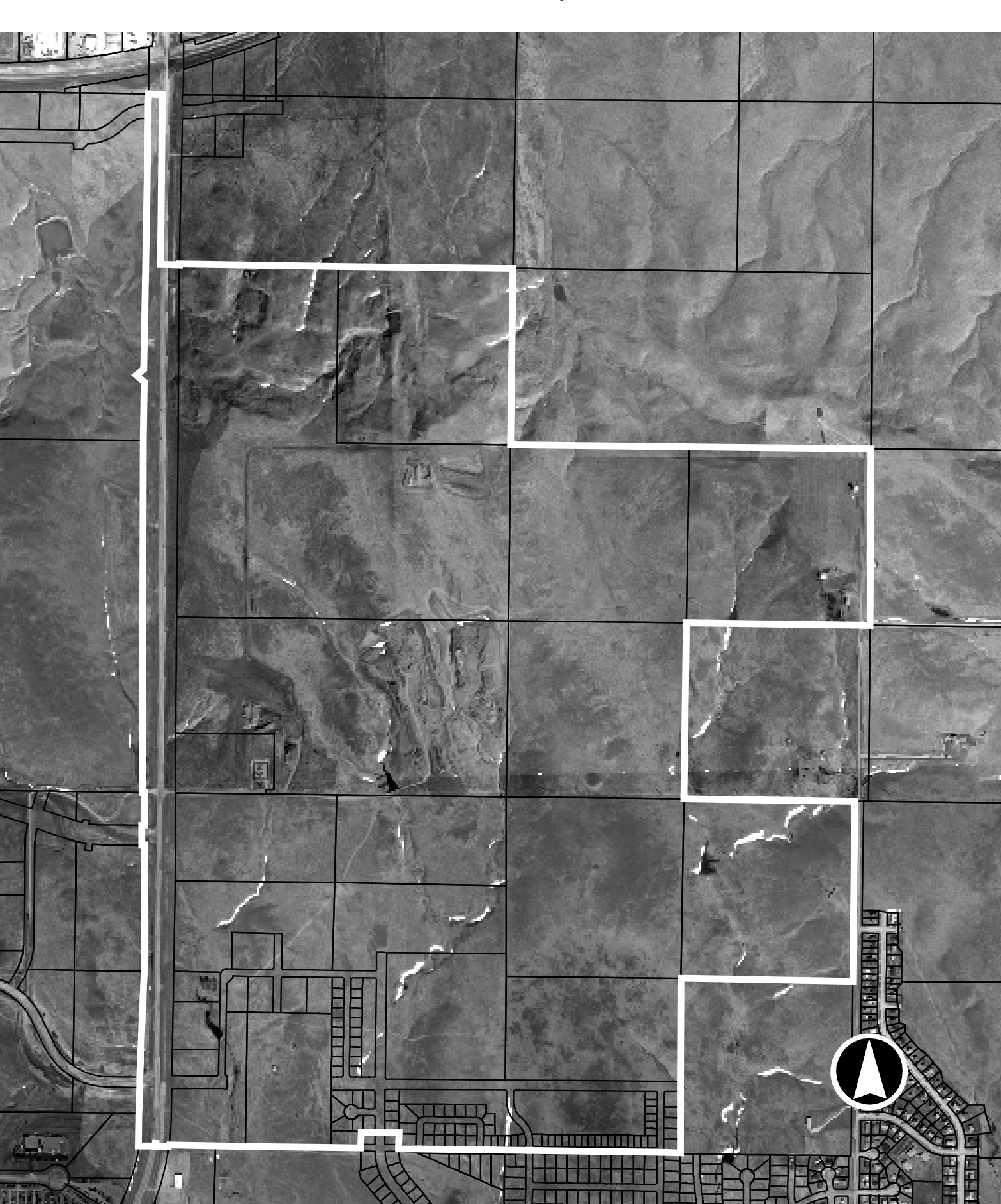
Tax Increment District No. 42 - Elk Vale Water / Timmons Blvd. Aerial Map