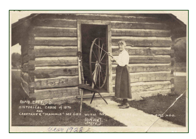
Cabin in use as a Museum, 1928