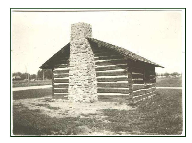
Cabin as it appeared shortly after it was moved in 1926 to Halley Park