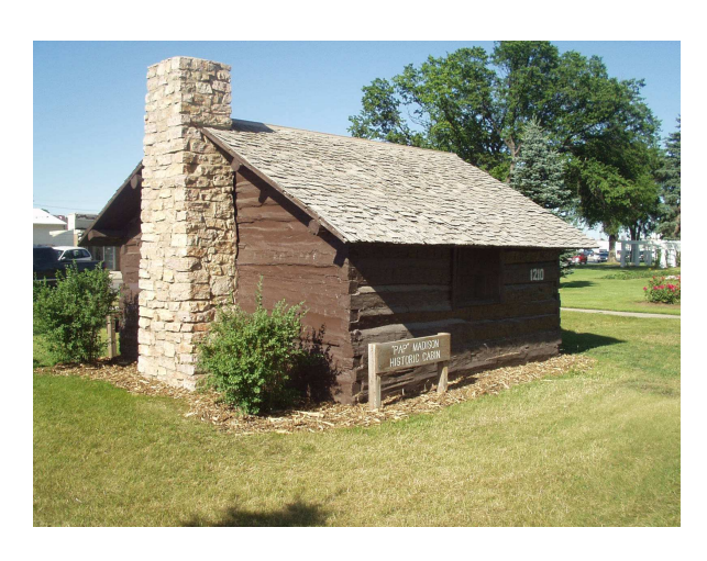
Cabin as it appears today