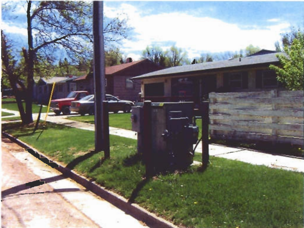
Located at 2733 West St. Patrick. Structure is 4' high, 1 ½' deep and 3 ½' wide.