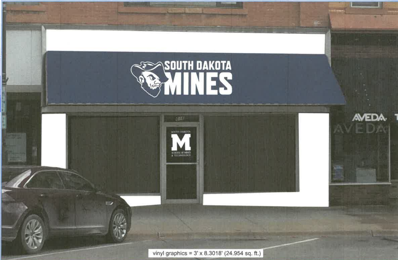
vinyl graphics = 3' x 8.3018' (24.954 sq. ft.)