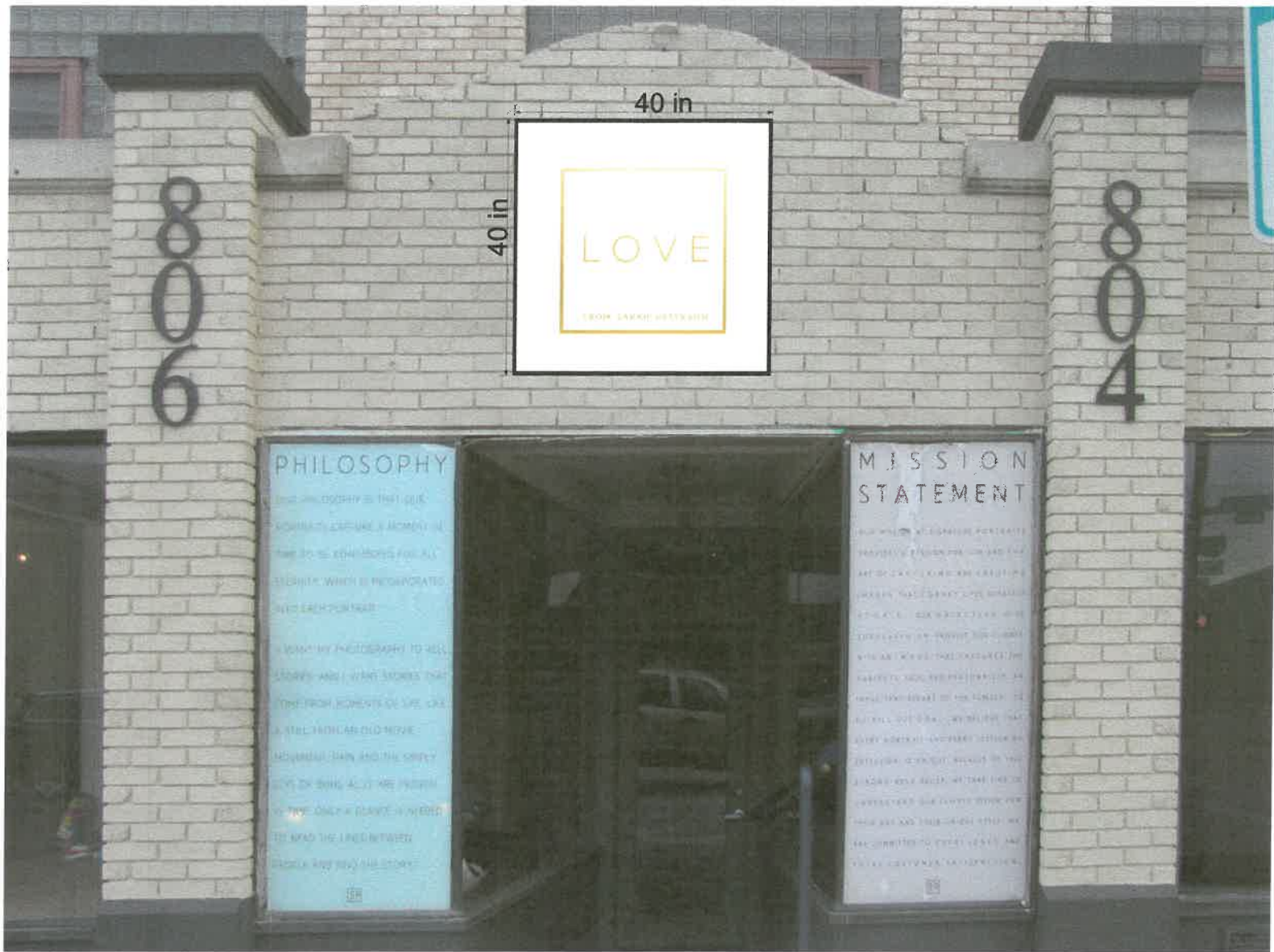
Approx 40"T x 40"W Dibond sign w/digitally printed graphics