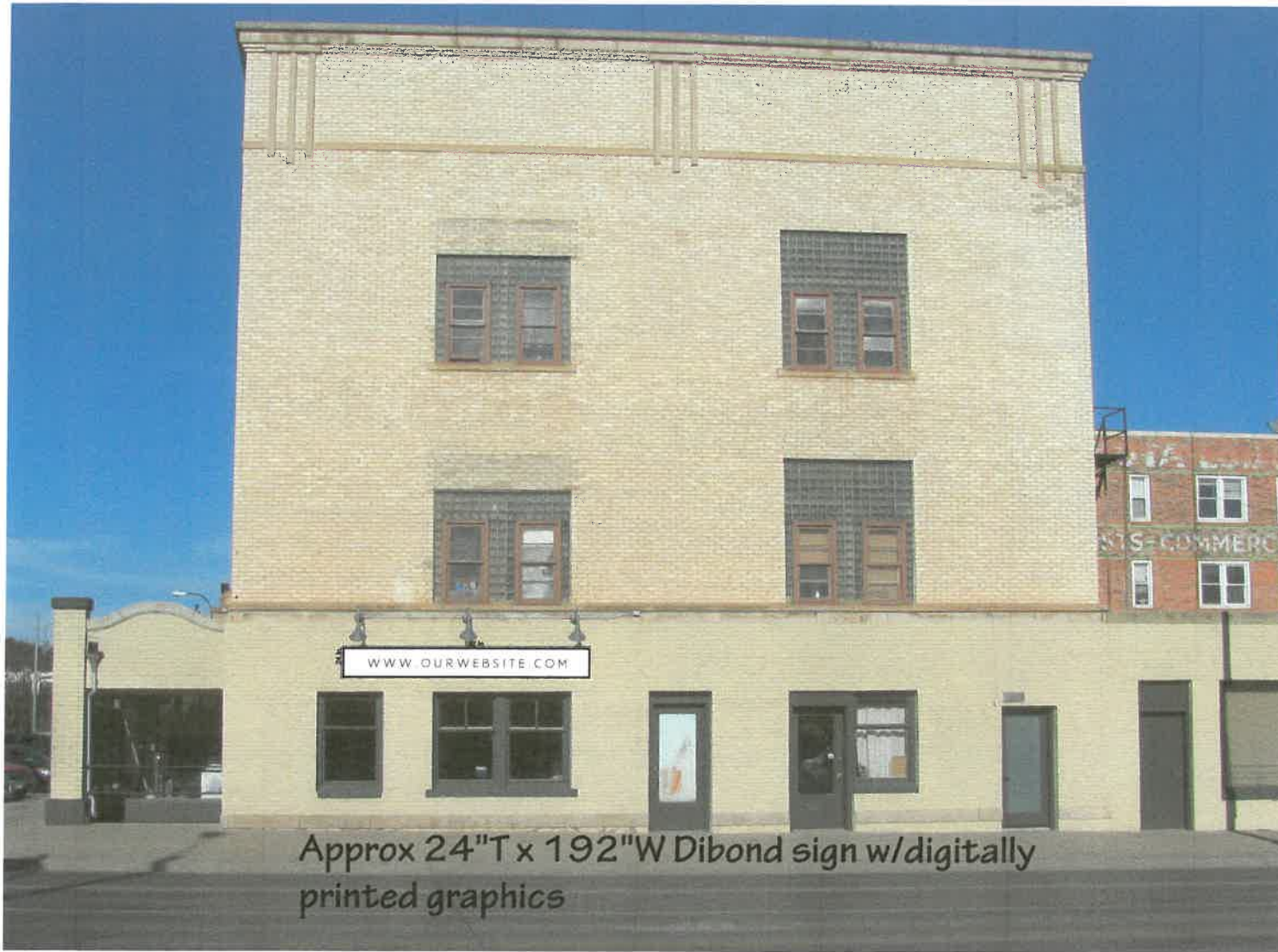
Approx 24" T x 192" W Dibond sign w/digitally printed graphics