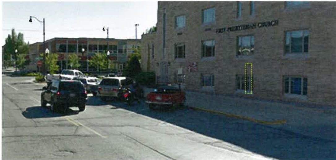
LOCATION - 32