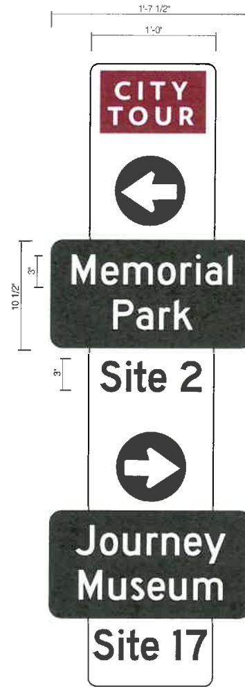
B SIGN ELEVATION 003 SCALE: 1 1/2" = 1'-0"