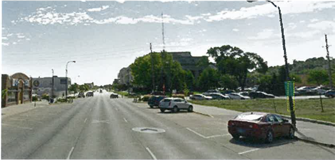
LOCATION - 33