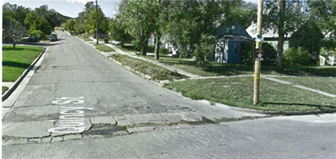
LOCATION - 26