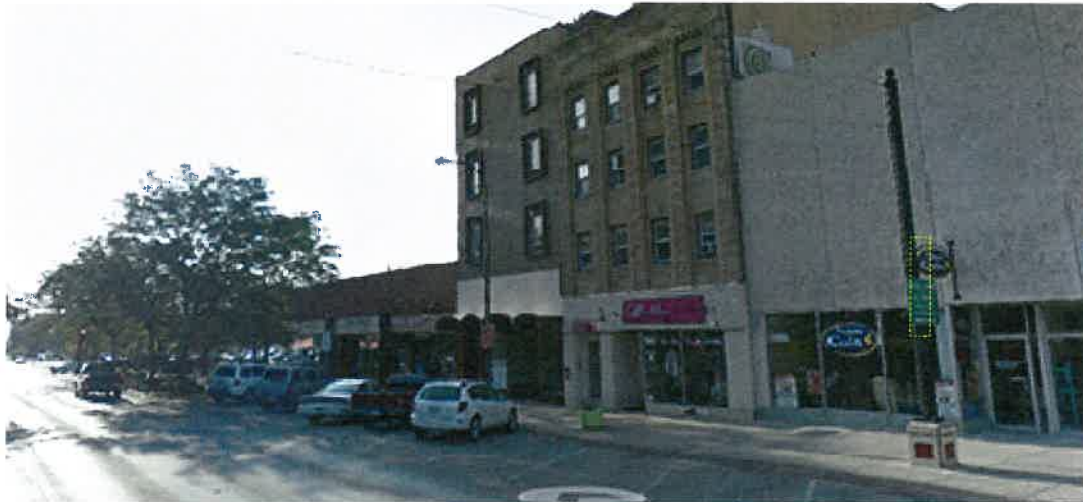
LOCATION - 3B