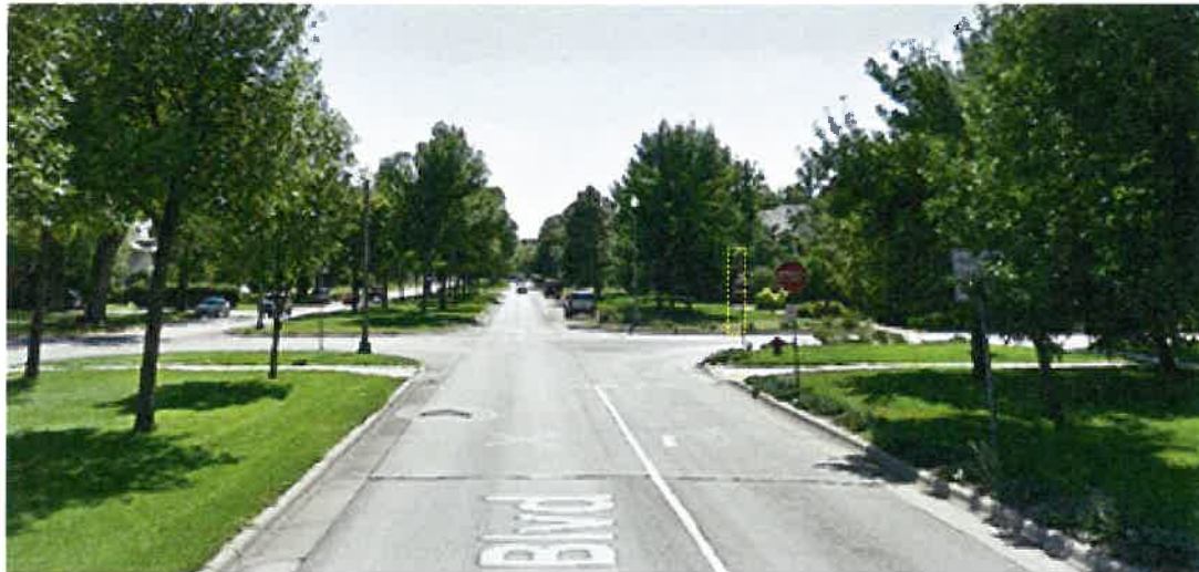
LOCATION - 25