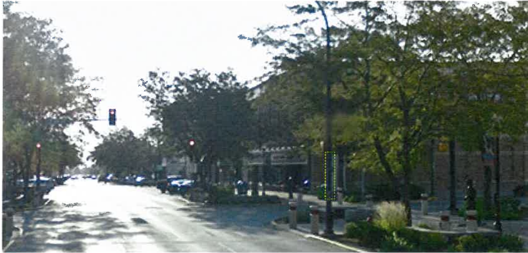
LOCATION - 31