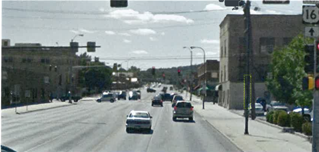
LOCATION - 29