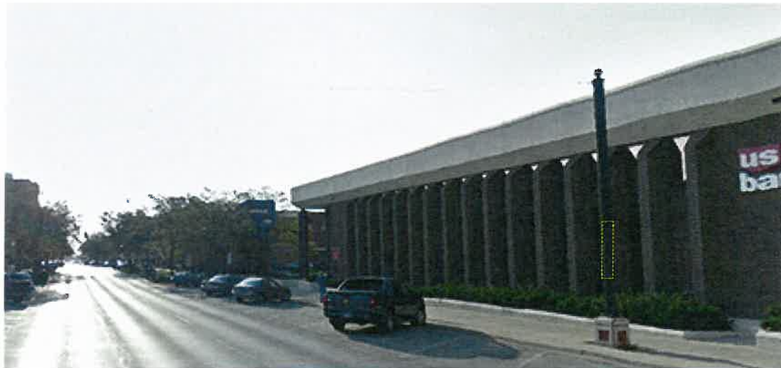
LOCATION - 30