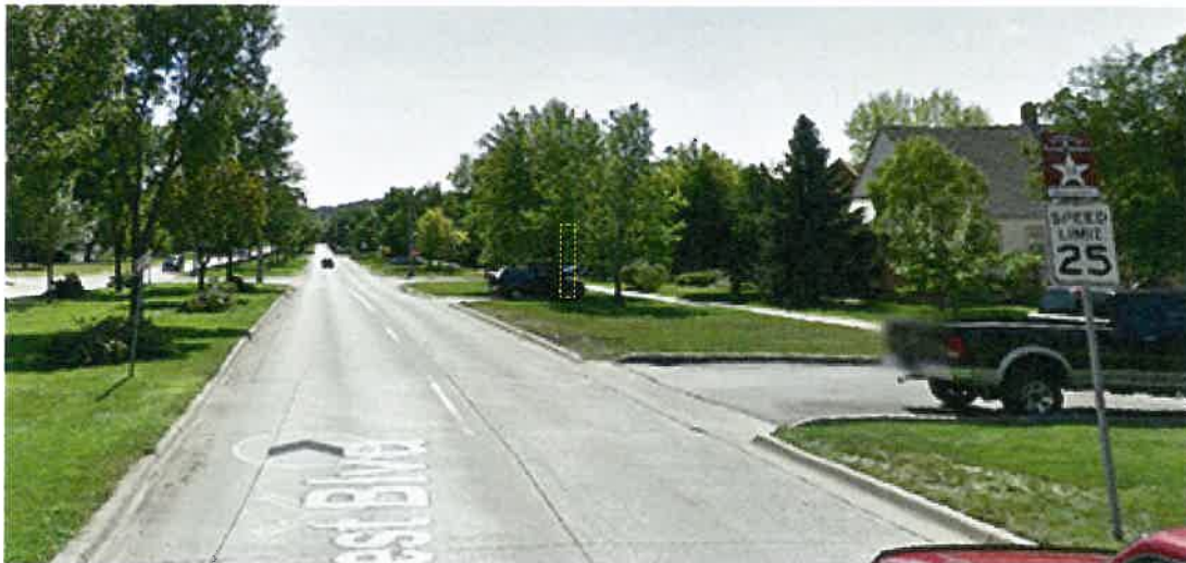
LOCATION - 27