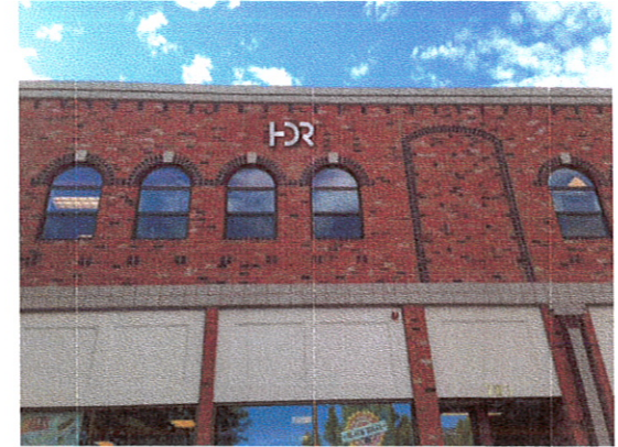
D Photo Elevation APPROX. SCALE 3/32" = 1'-0"