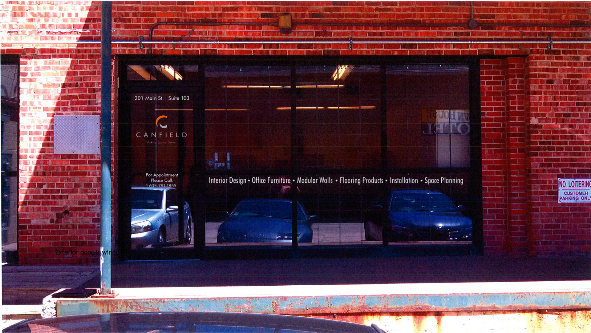
Exterior door & window

Copyright Notice © This drawing and all reproductions thereof are the property of Unique Signs and may not be reproduced, published, changed or used in any way without written consent.