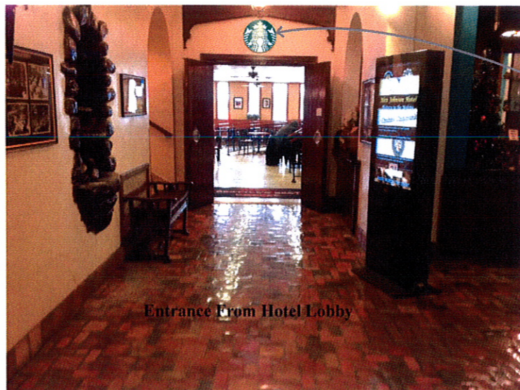
Entrance From Hotel Lobby

New 18" illuminated Evolved disk (verify size in field)