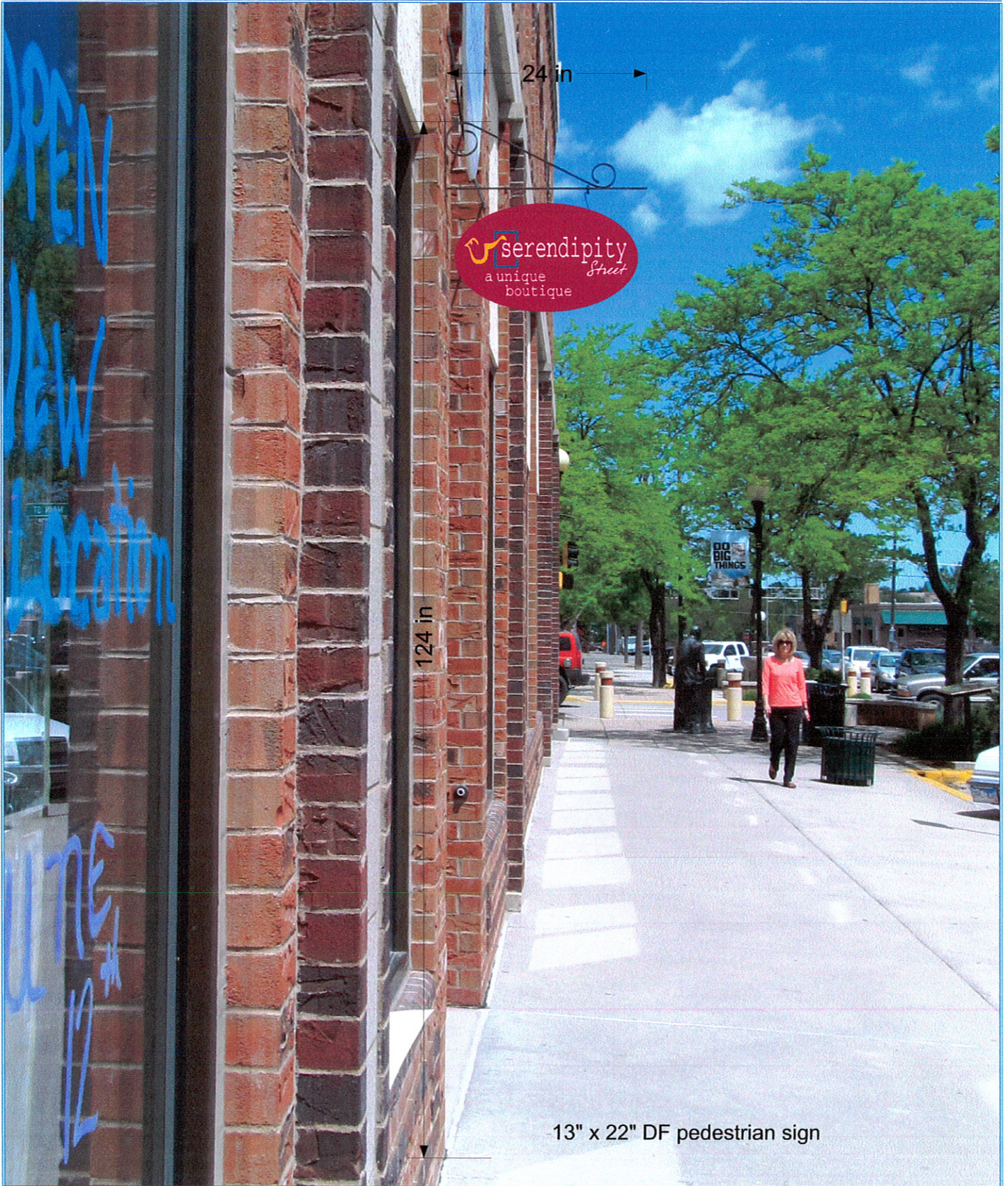
13" x 22" DF pedestrian sign