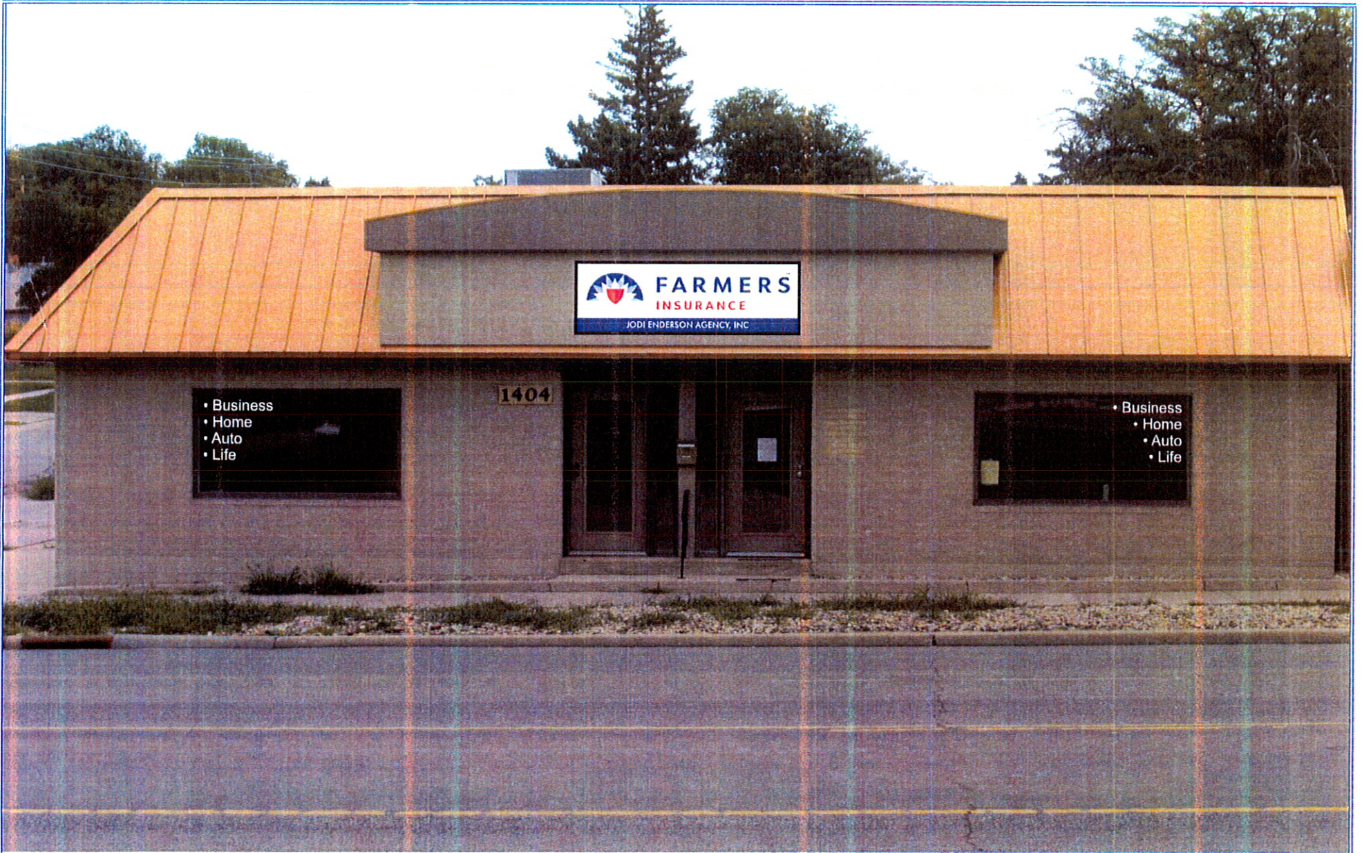
3' x 9' 1" internally illuminated wall sign, (2) 29" x 33" window graphics