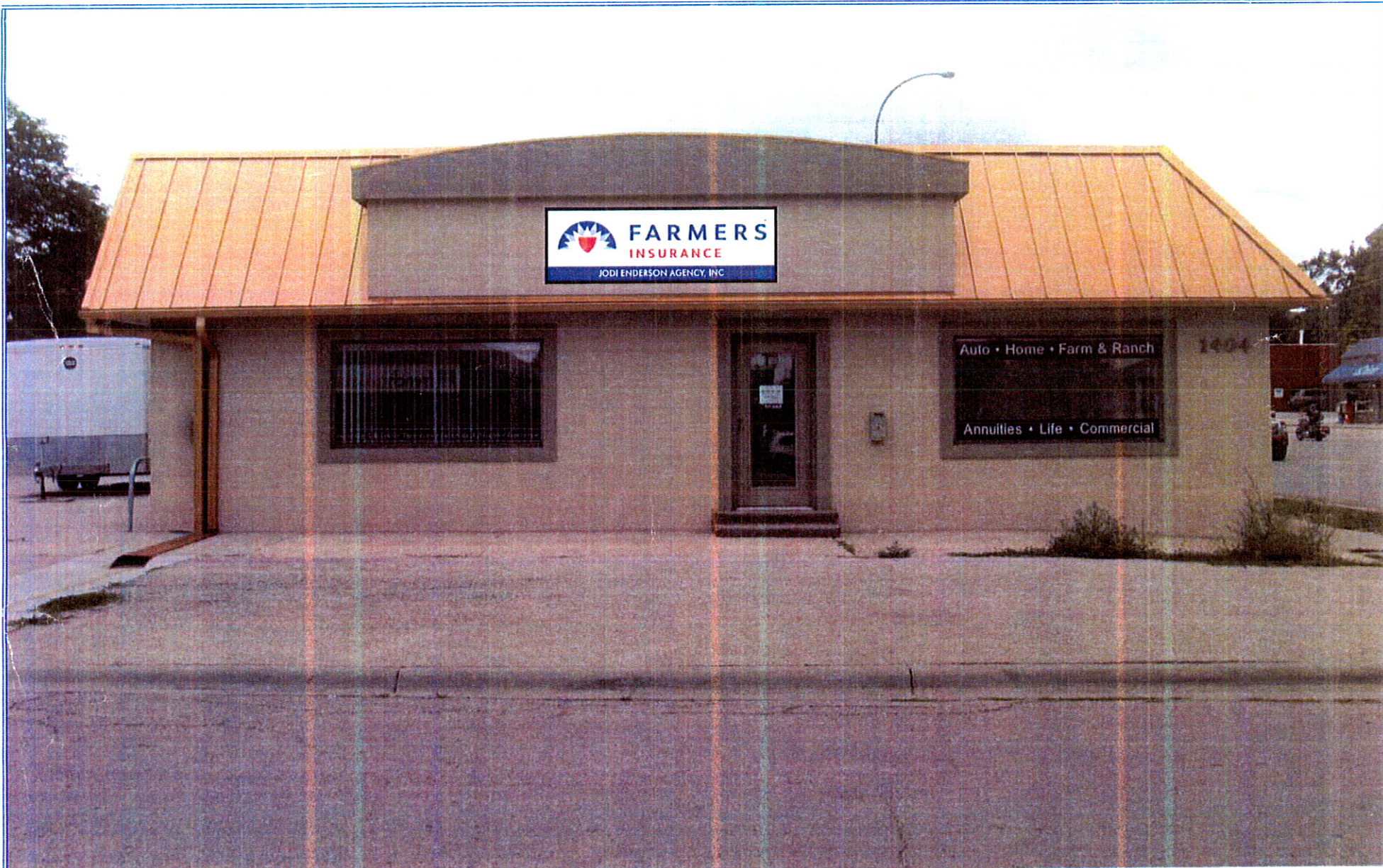
3' x 9' 1" internally illuminated wall sign