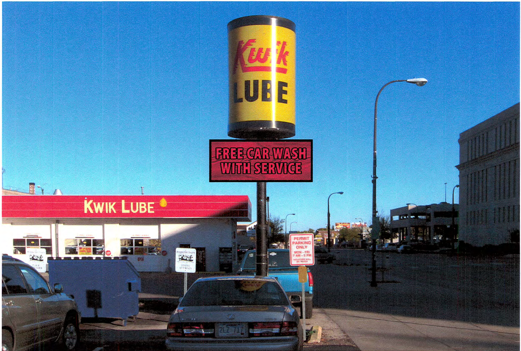
37.625" x 91.1875" red grayscale message center