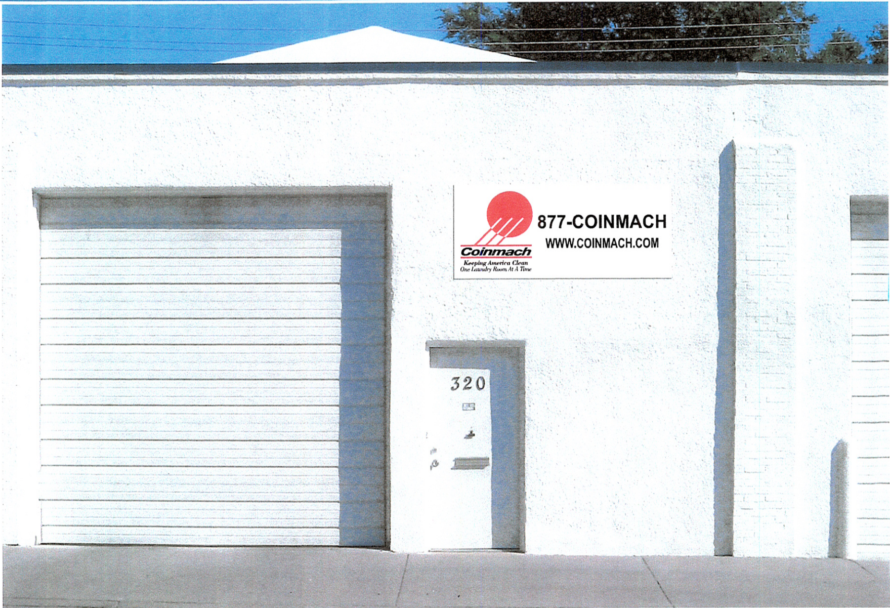
Sign Dimensions: 3' x 9'