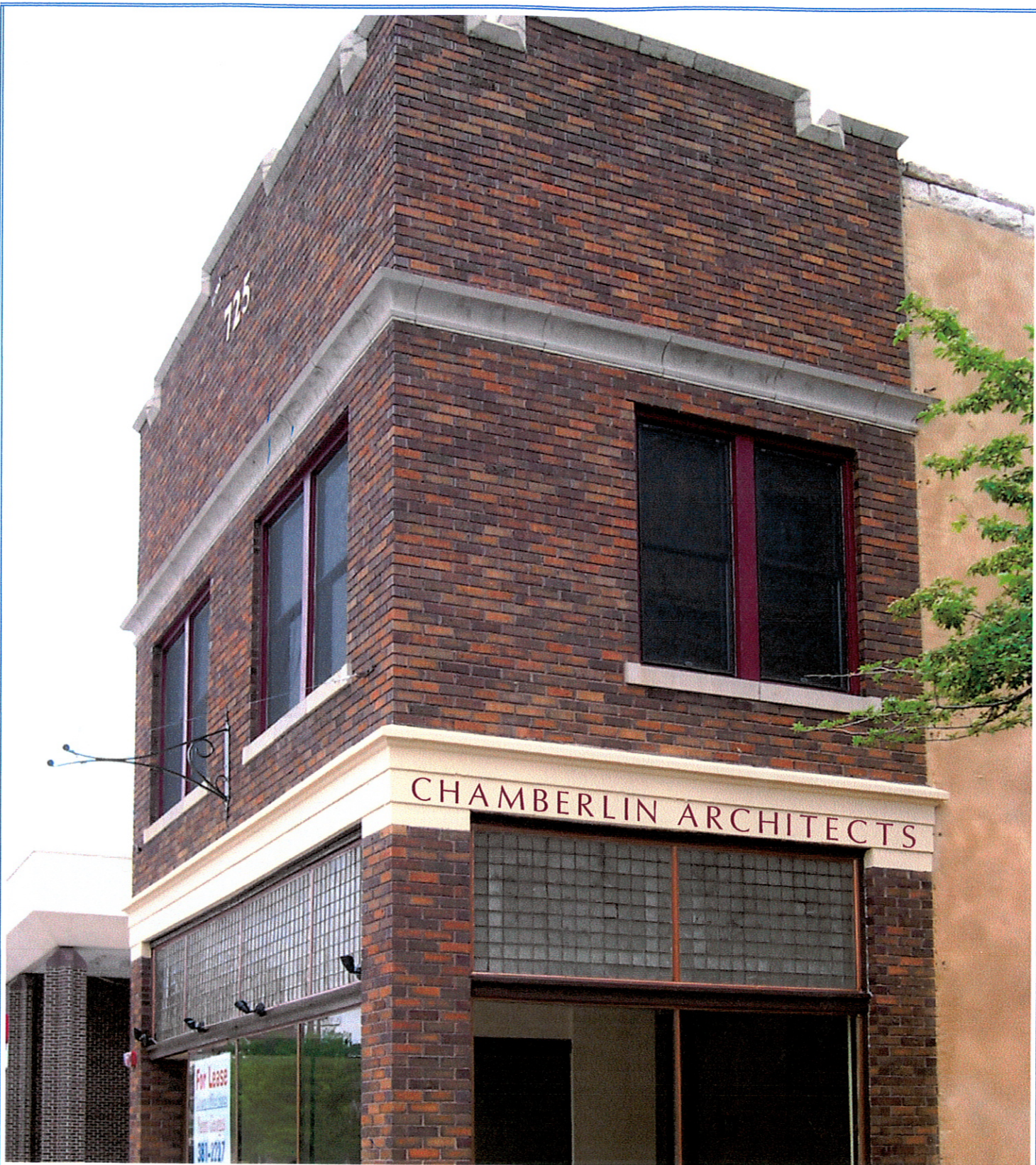
6" Painted Letters (Optima font)