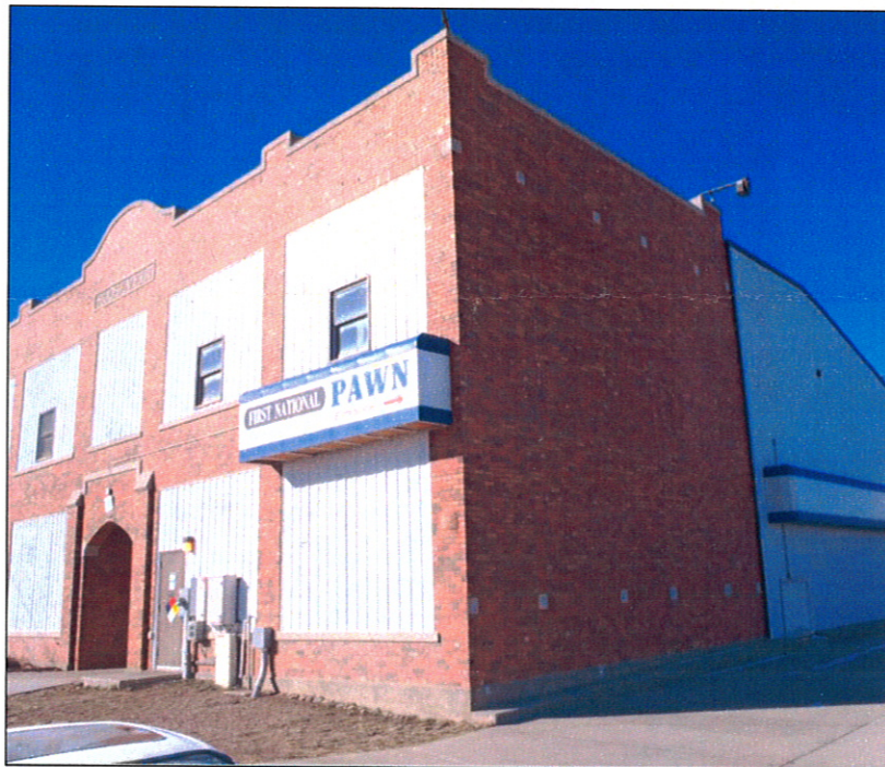
PN00000915 view southwest. D. Hahs 02/27/2014.