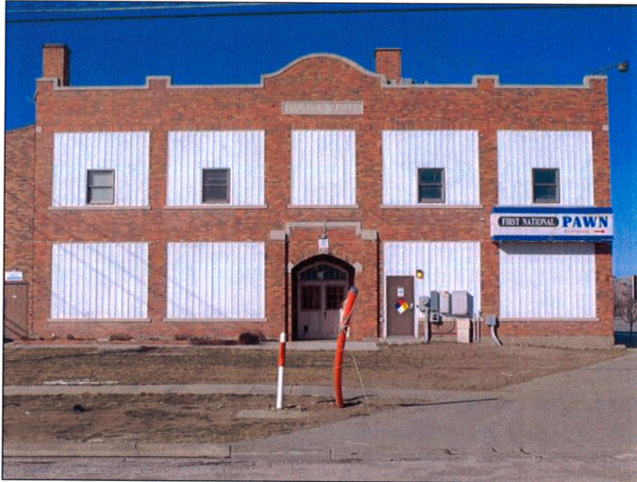
PN00000915 view west of east façade. D. Hahs 02/27/2014.