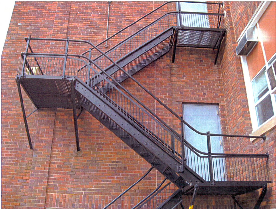
West Exterior Stair – Previously Completed