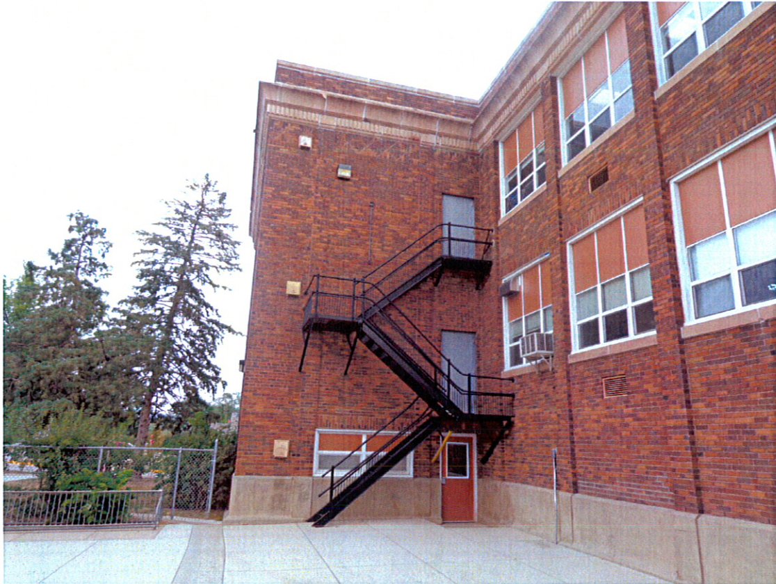
West Exterior Stair – Previously Completed