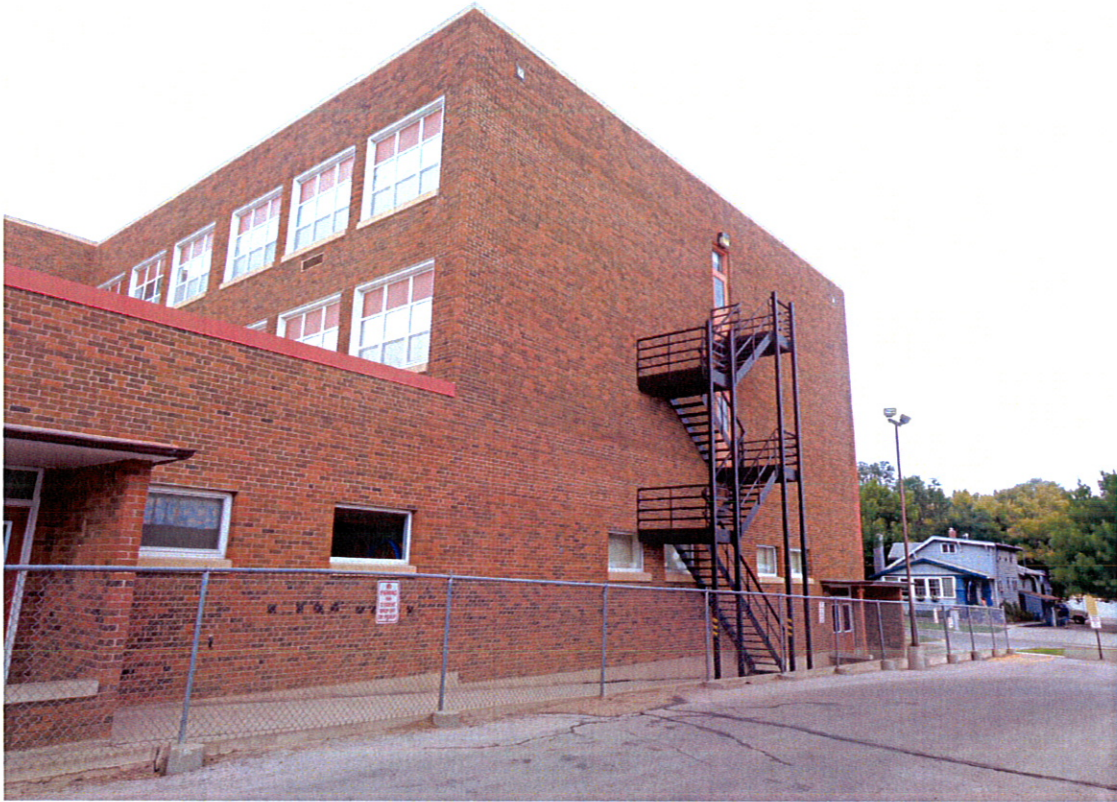
East Exterior Stair To Be Renovated - Add Vertical Railings