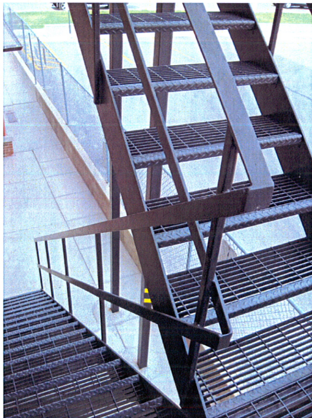
East Exterior Stair To Be Renovated – Add Vertical Railings