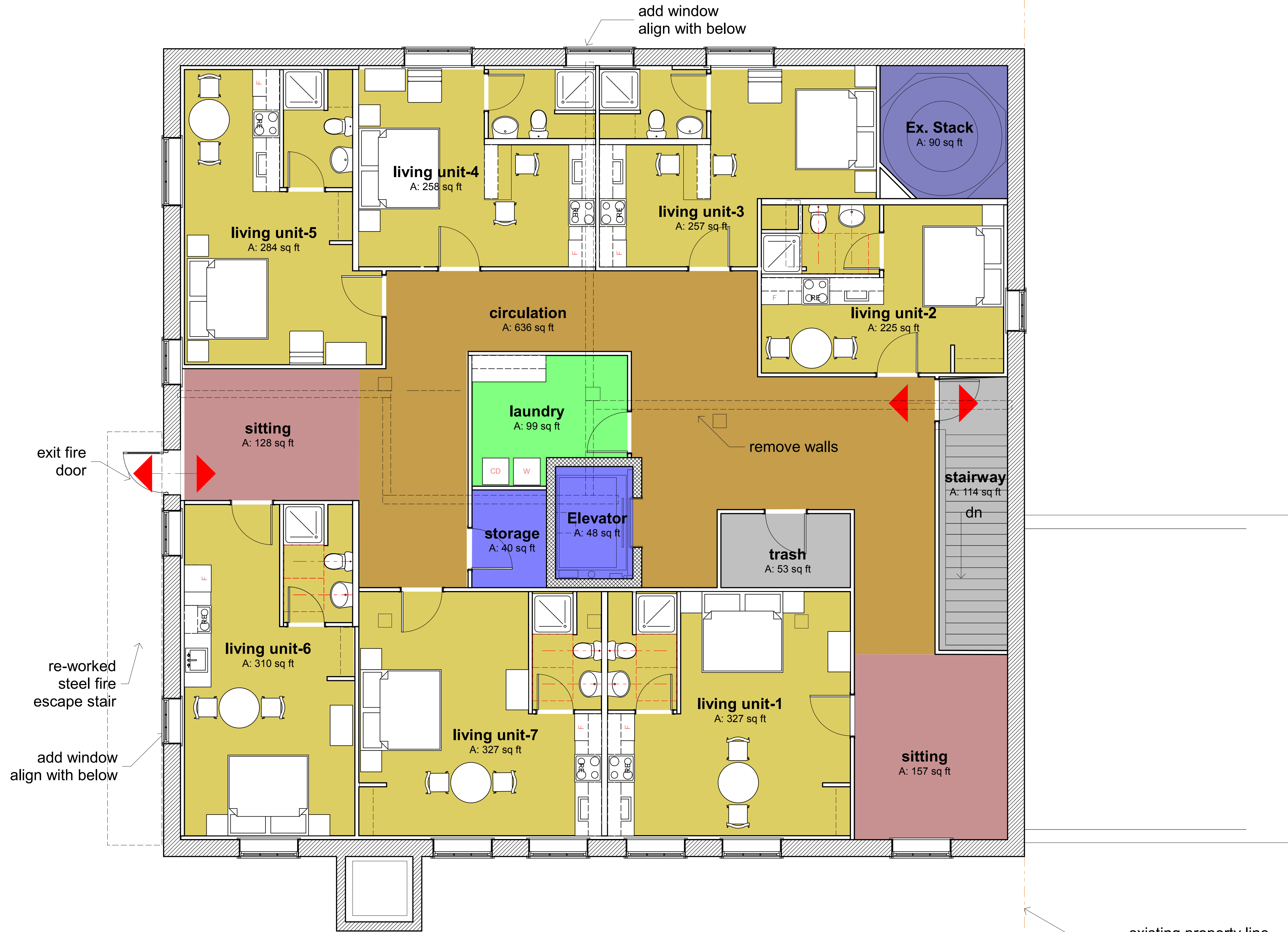
2RD FLOOR A: 3,838 sq ft 3838/50 gsf = 76.76 occupants