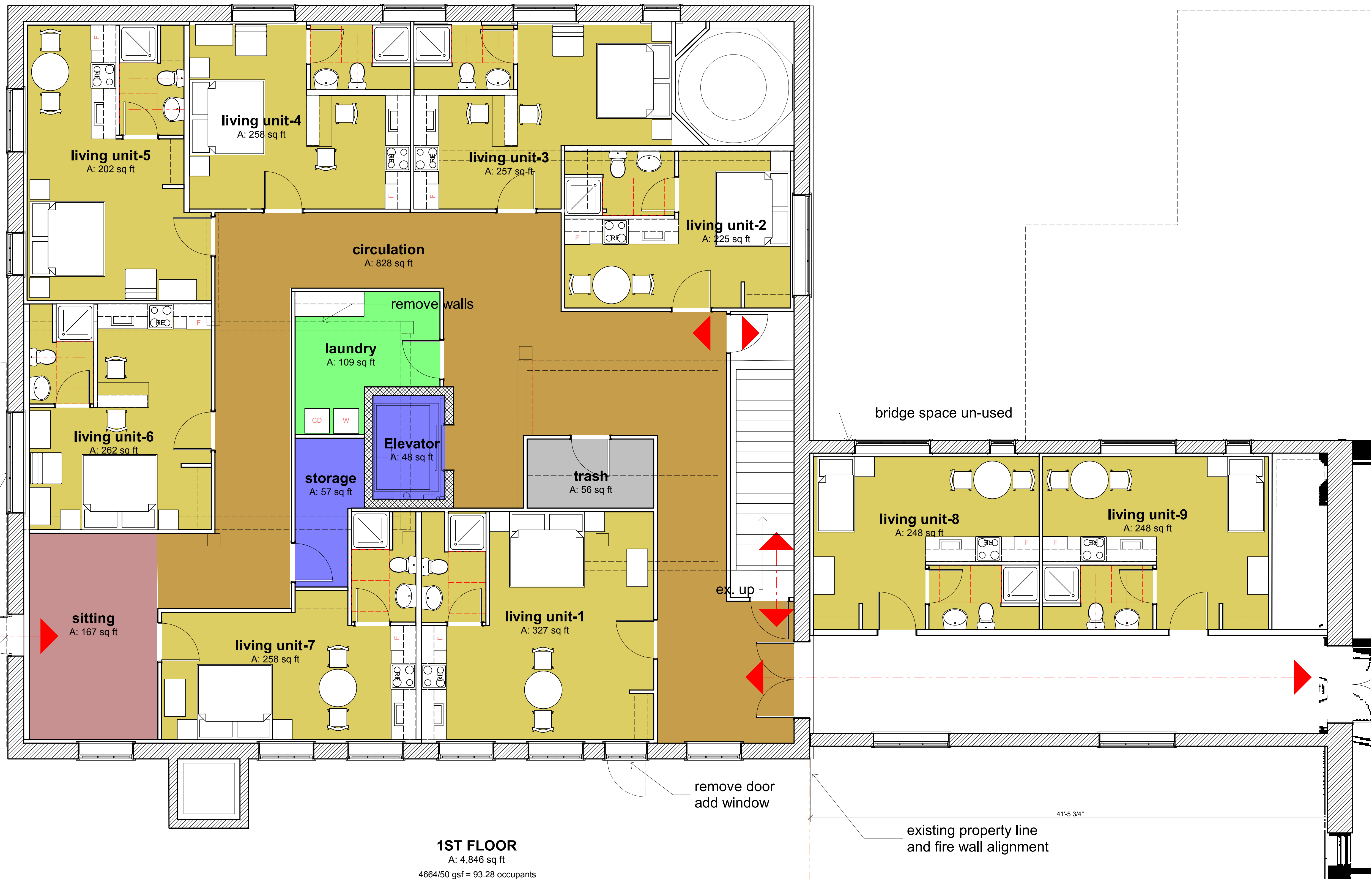
1ST FLOOR A: 4,846 sq ft 4664/50 gsf = 93.28 occupants