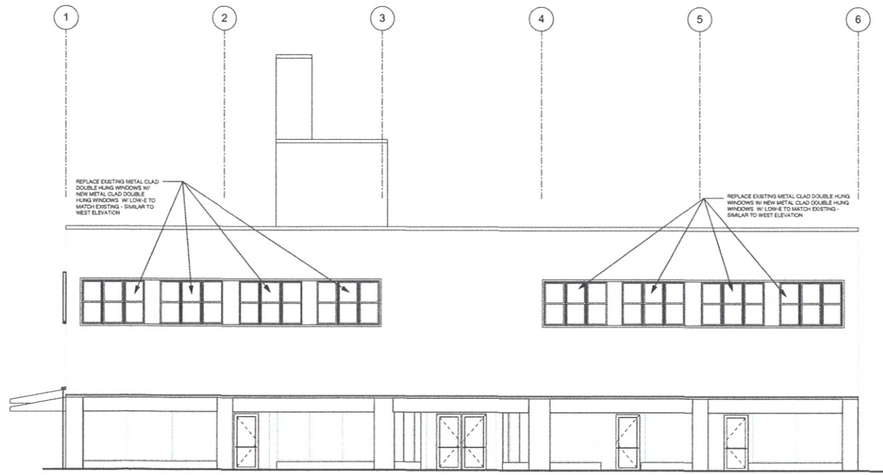
1 South Elevation A3.0 Scale 1/8" = 1'-0"